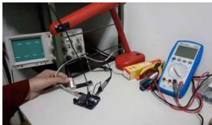
Figure 2. Application of physics laboratory in robotics

based signal processing and data analysis techniques are employed to extract meaningful information from sensor data and enable robots to perceive and interact with their surroundings. Physics-based control systems are used to regulate the behavior and performance of robots. Physics principles, such as feedback control theory, are applied to design control algorithms that enable robots to achieve desired positions, velocities, and forces. These control systems utilize physical models of robots and their interactions with the environment to achieve accurate and robust control[4]. Physics concepts, such as motion, forces, and energy, are essential in the study of robot locomotion and mobility.