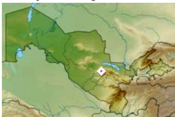
Location of the Suffa RT-70 radio telescope

Construction of the Radio Telescope-RT-70 observatory on the Suffa Plateau in the Zaamin district of Jizzakh province began in 1981 but was stopped in 1991.